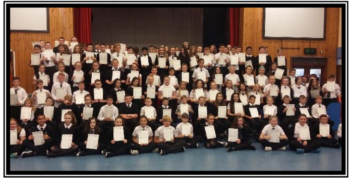
Pupils display their John Muir Award certificates

Congratulations also to S2 pupils who secured the John Muir Level 1 Award through their involvement in outdoor learning experiences at the Dean Park last session which involved litter picking, planting trees and shrubs and so on and, as such they contributed to improving a local amenity.