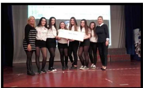
The winning team with the £3000 cheque which they won for their chosen charity

AYRSHIRE CANCER SUPPORT > supporting cancer patients and their families throughout Scotland.