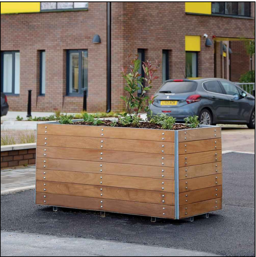
Broxap 1.8m Kirkland Planter Ref.(EAC1) to be attached accordingly