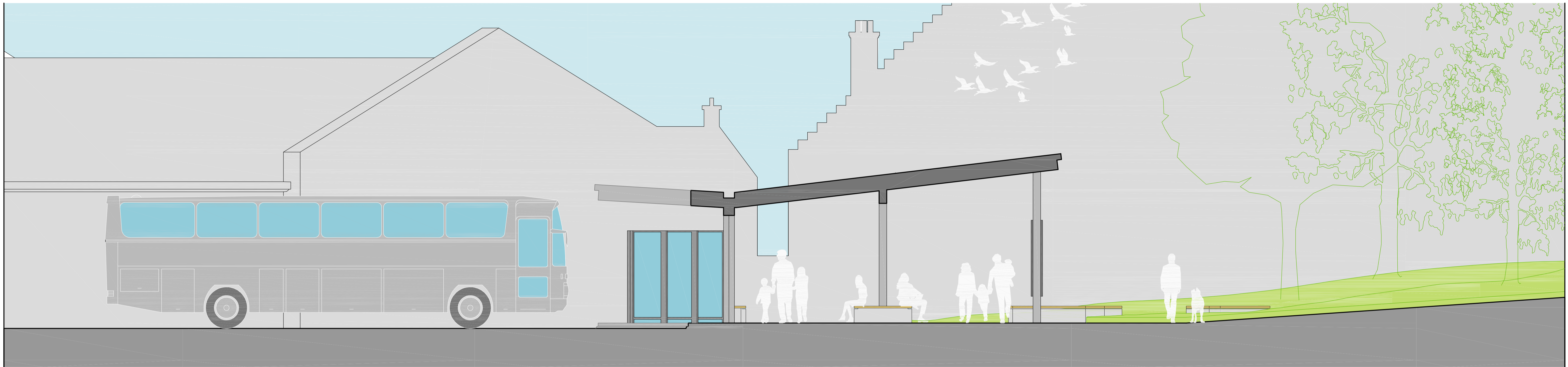
PROPOSED SECTION A 1:50