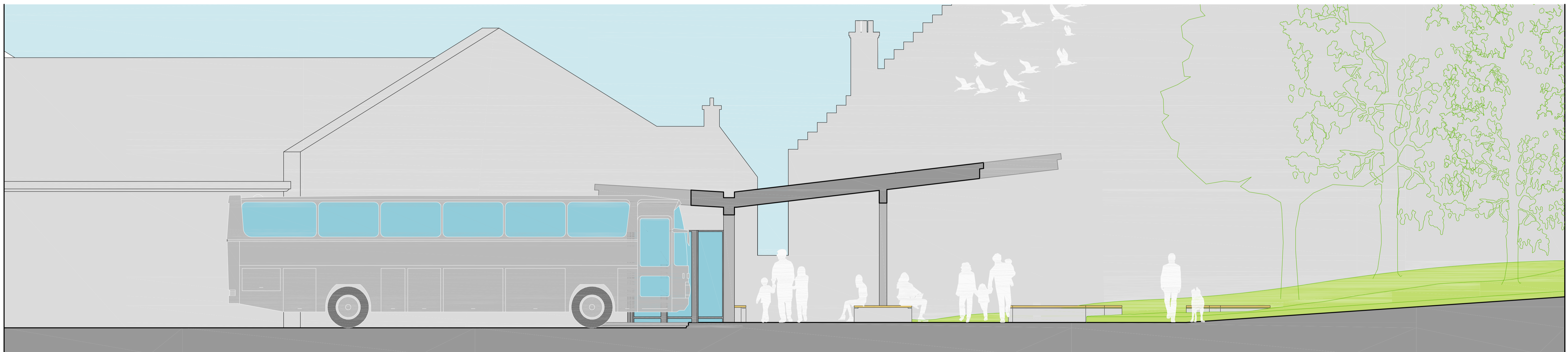
PROPOSED SECTION B 1:50