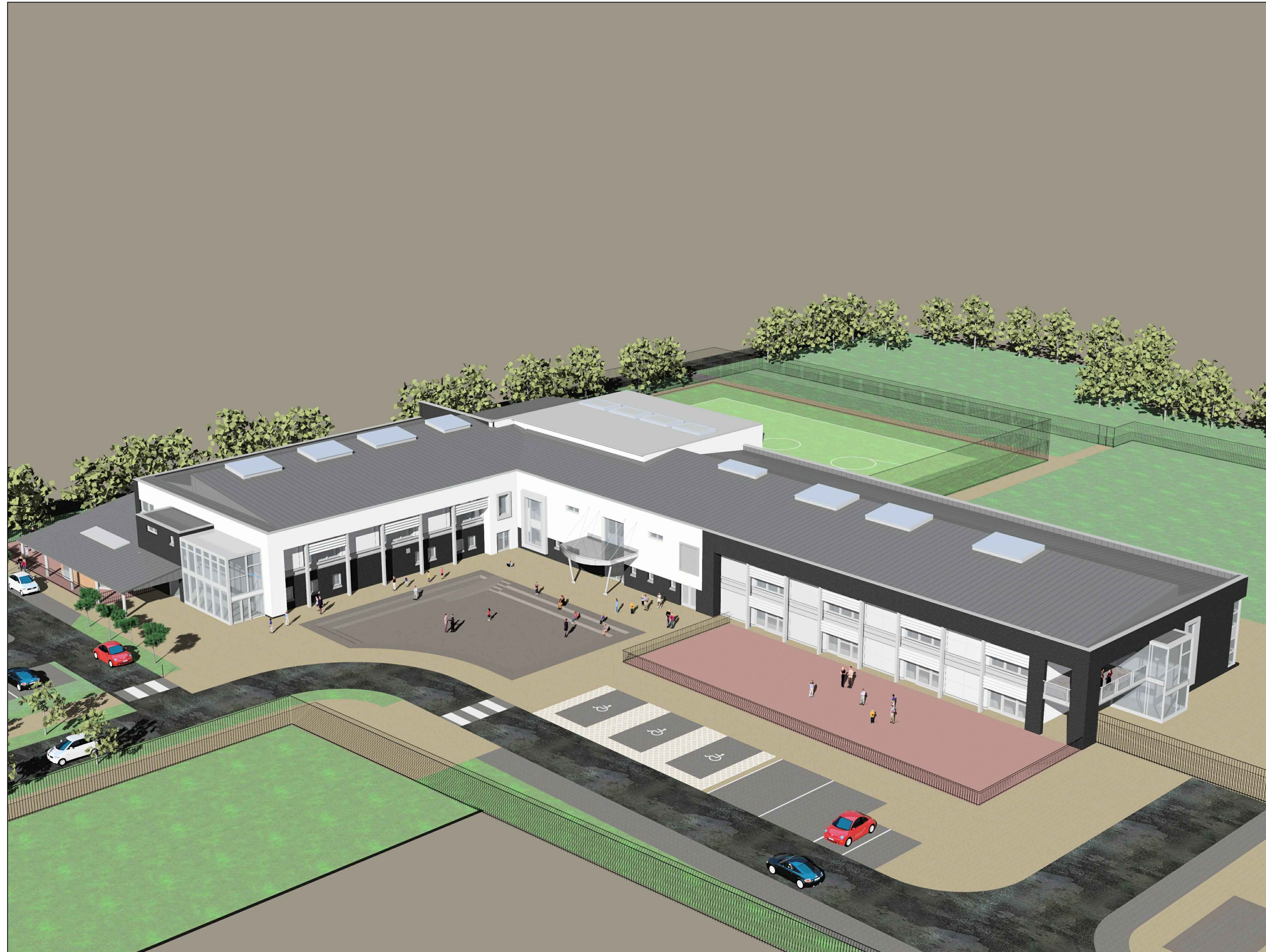
Aerial View of South East Elevations

SIZING : This drawing must not be scaled, only written dimensions to be respected. Contractor must verify all necessary sizes & particulars on site prior to commencing work.