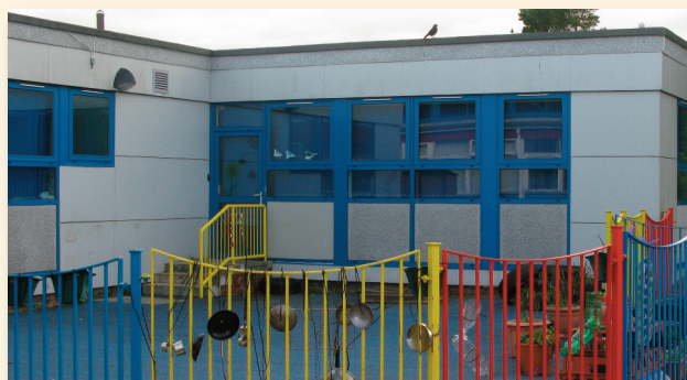
Making it Happen - 19