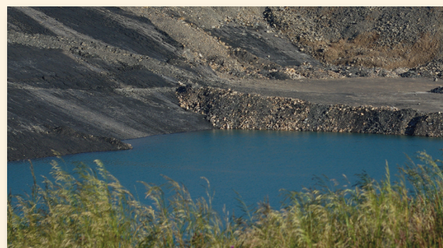
Main Strategies & Priorities - 10-12