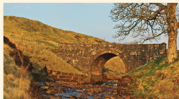
Muirkirk 2020: Our Vision for the Future - 8/9