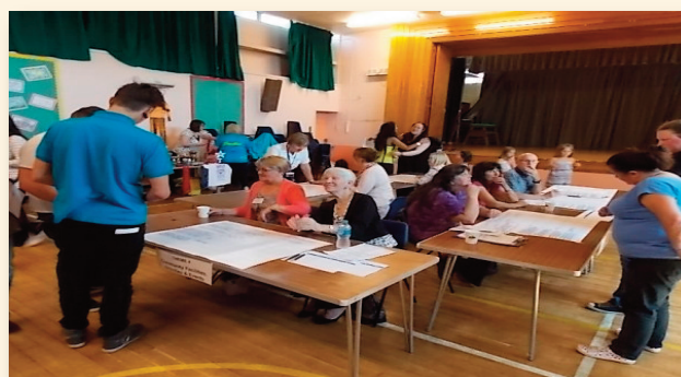
Our Community Facts & Figures 4/5 Likes/Dislikes - 6/7