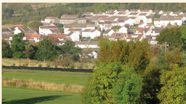
Introduction - 3

In 1755 Tibbie Pagan poetess arrived in Muirkirk. DID YOU KNOW ?