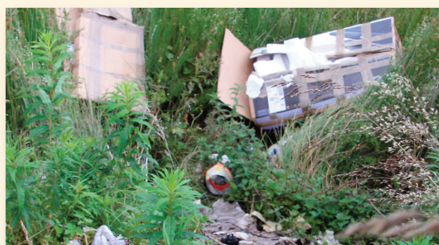
Action - 13-17