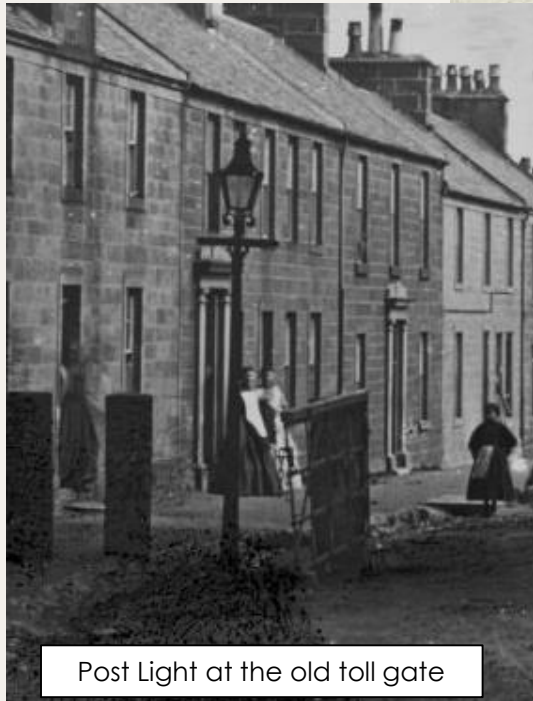
Post Light at the old toll gate

In accordance with historic pictures of the village there was only two locations which hosted a post style light. These were of two different designs as noted opposite.