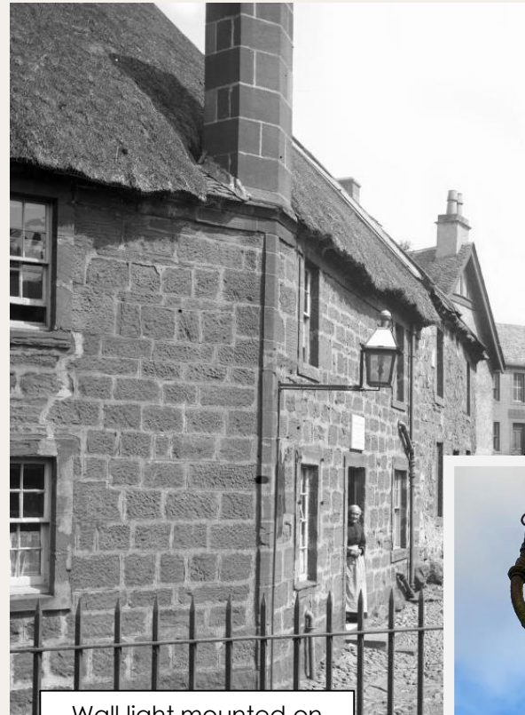
Wall light mounted on Burns House

Interestingly a wall light bracket which was originally located at 23 Loudoun street now adorns the private residence of 'Springfield', Mansefield road. Although slightly adapted from its original style.