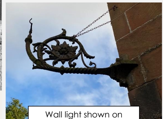
Wall light shown on Springfield, moved from Loudoun St