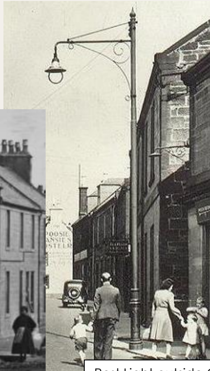
Post Light outside Co-op