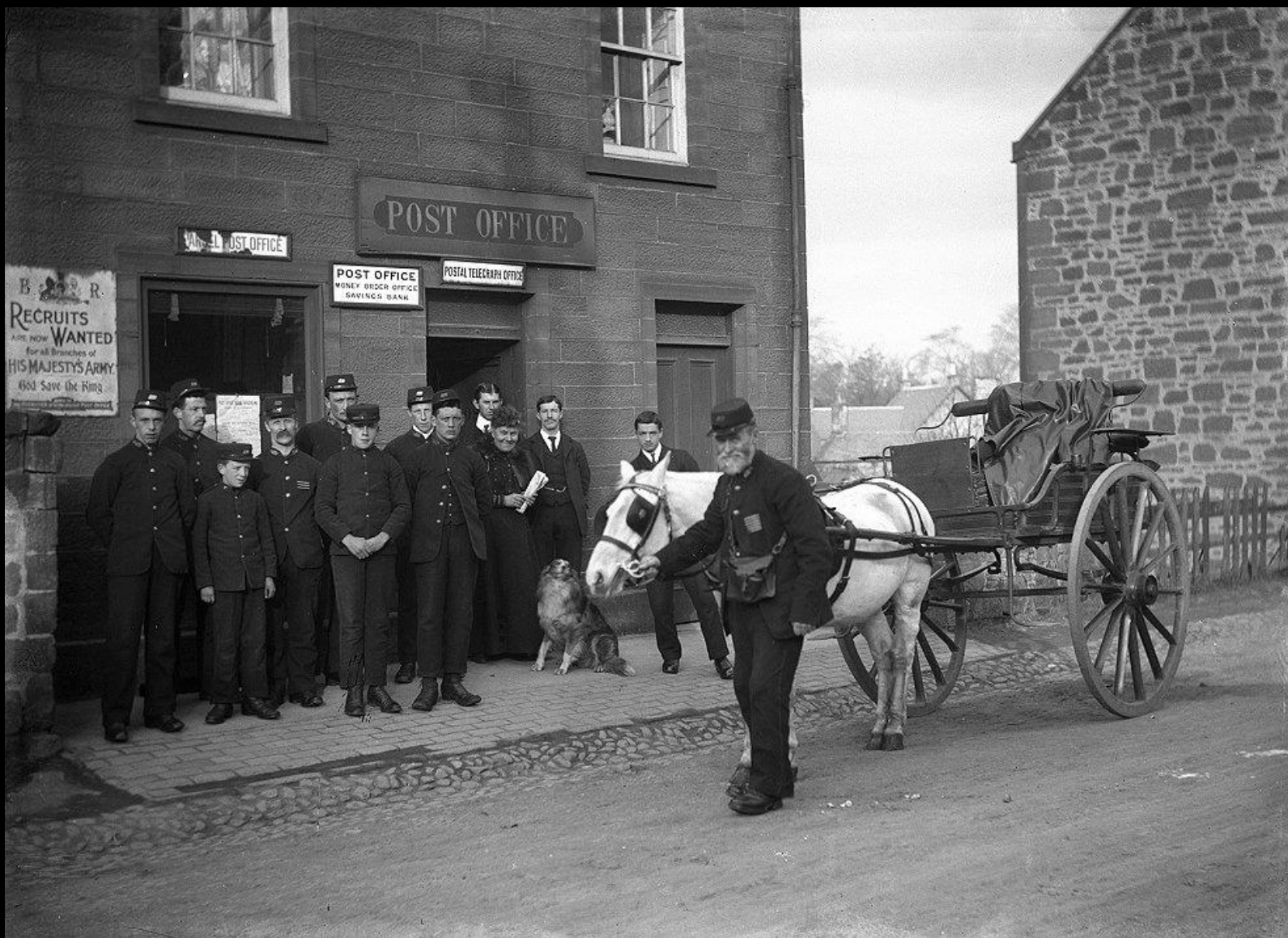
Mauchline Post Office, New Road now Castle Cafe