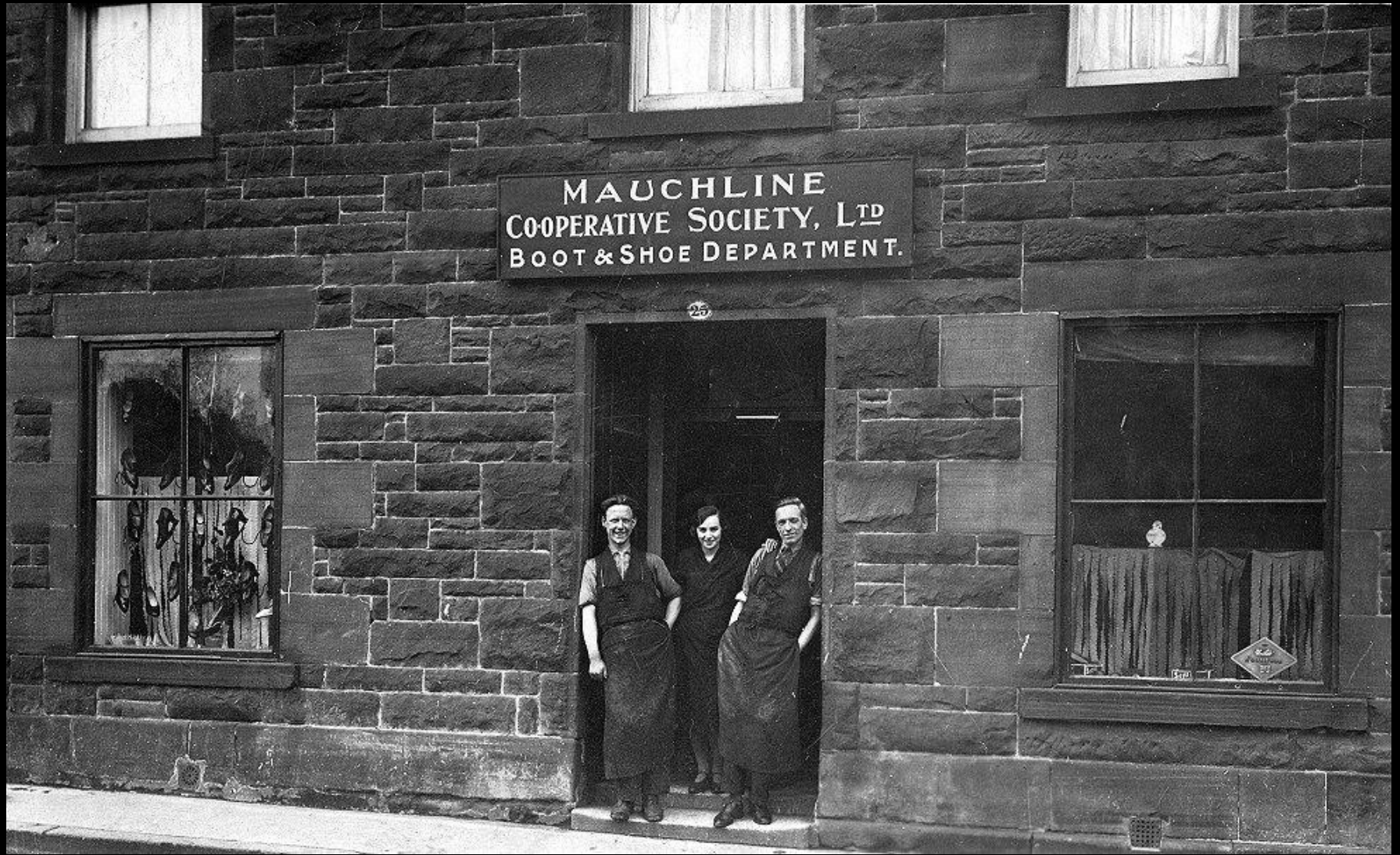
Co-Operative Boot & Shoe Department, 23-25 Loudoun Street