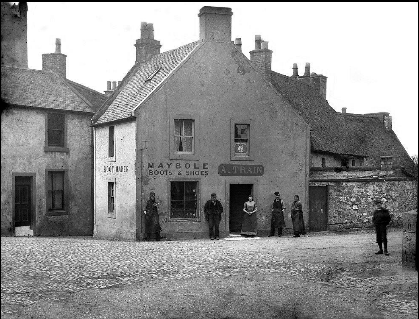
1 Kilmarnock Road now Mauchline Dental Surgery