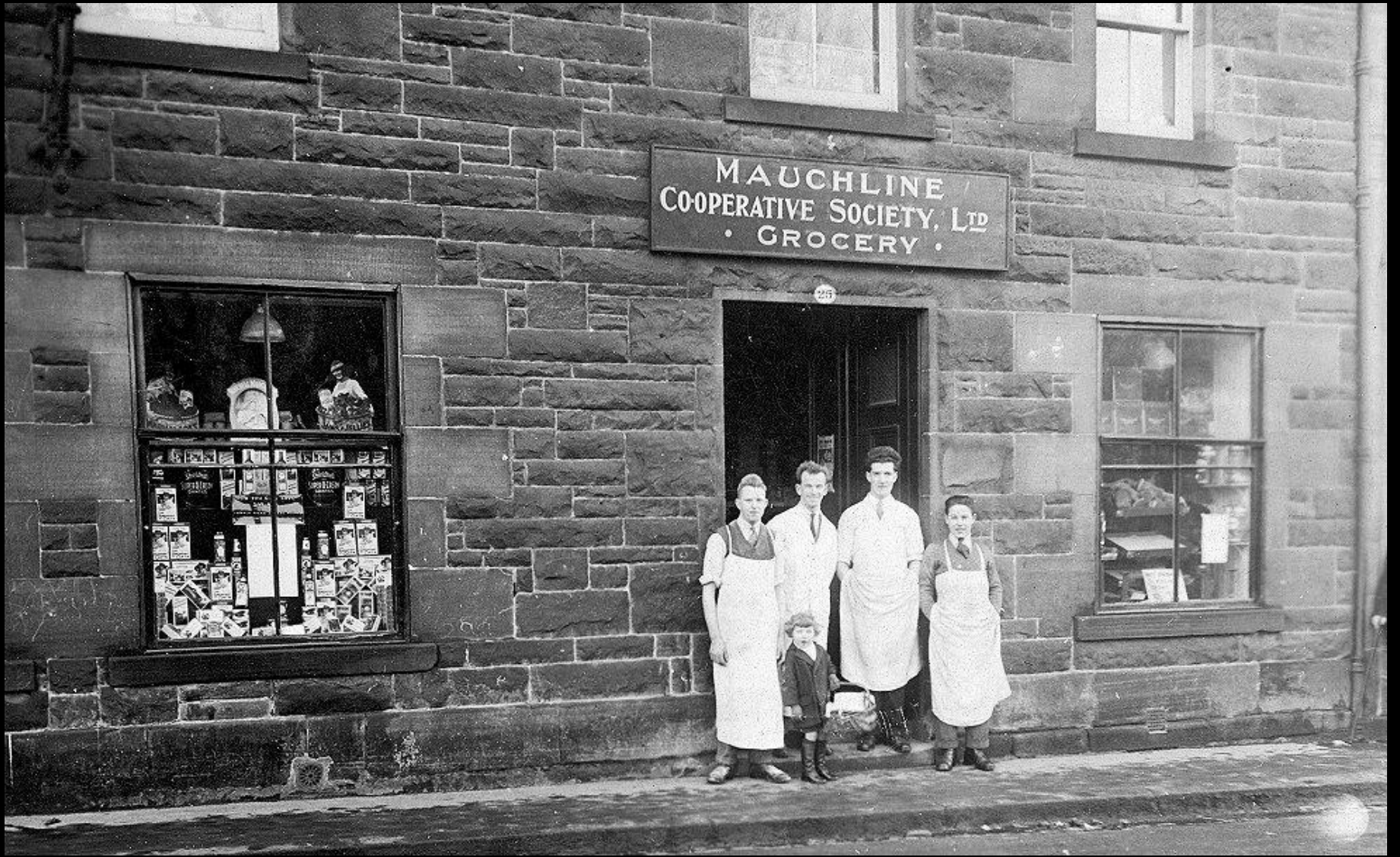
Co-Operative Grocery, 23-25 Loudoun Street