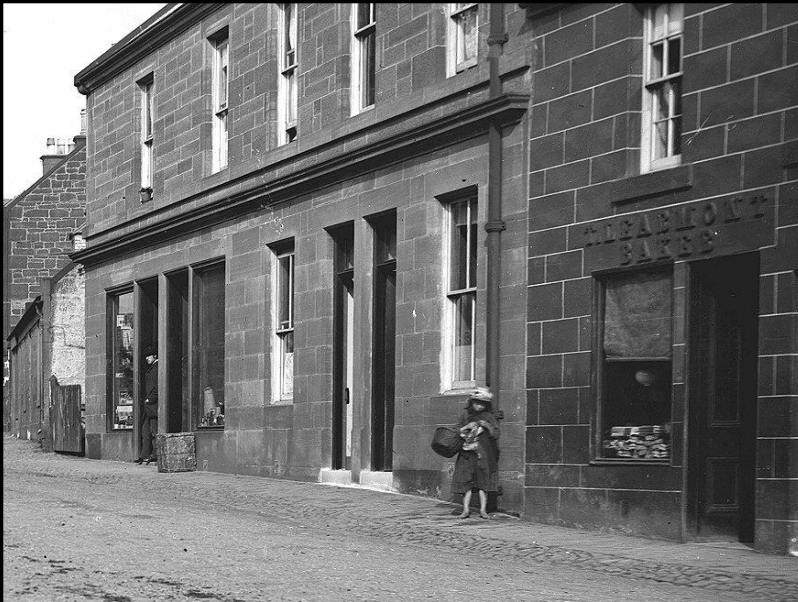
43-51 Loudoun Street now the Co-op