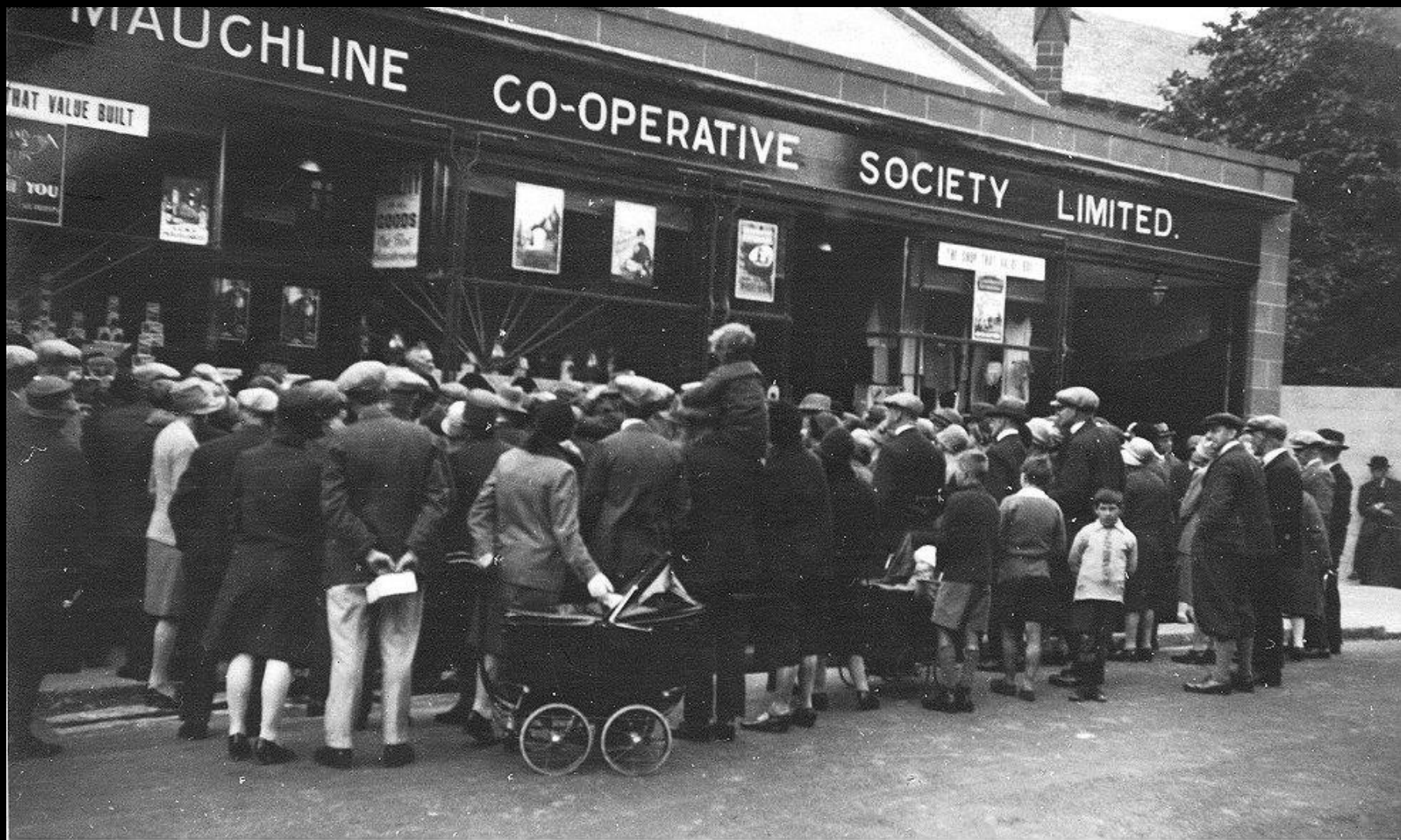
Co-Operative Society, 4 & 6 Loudoun Street