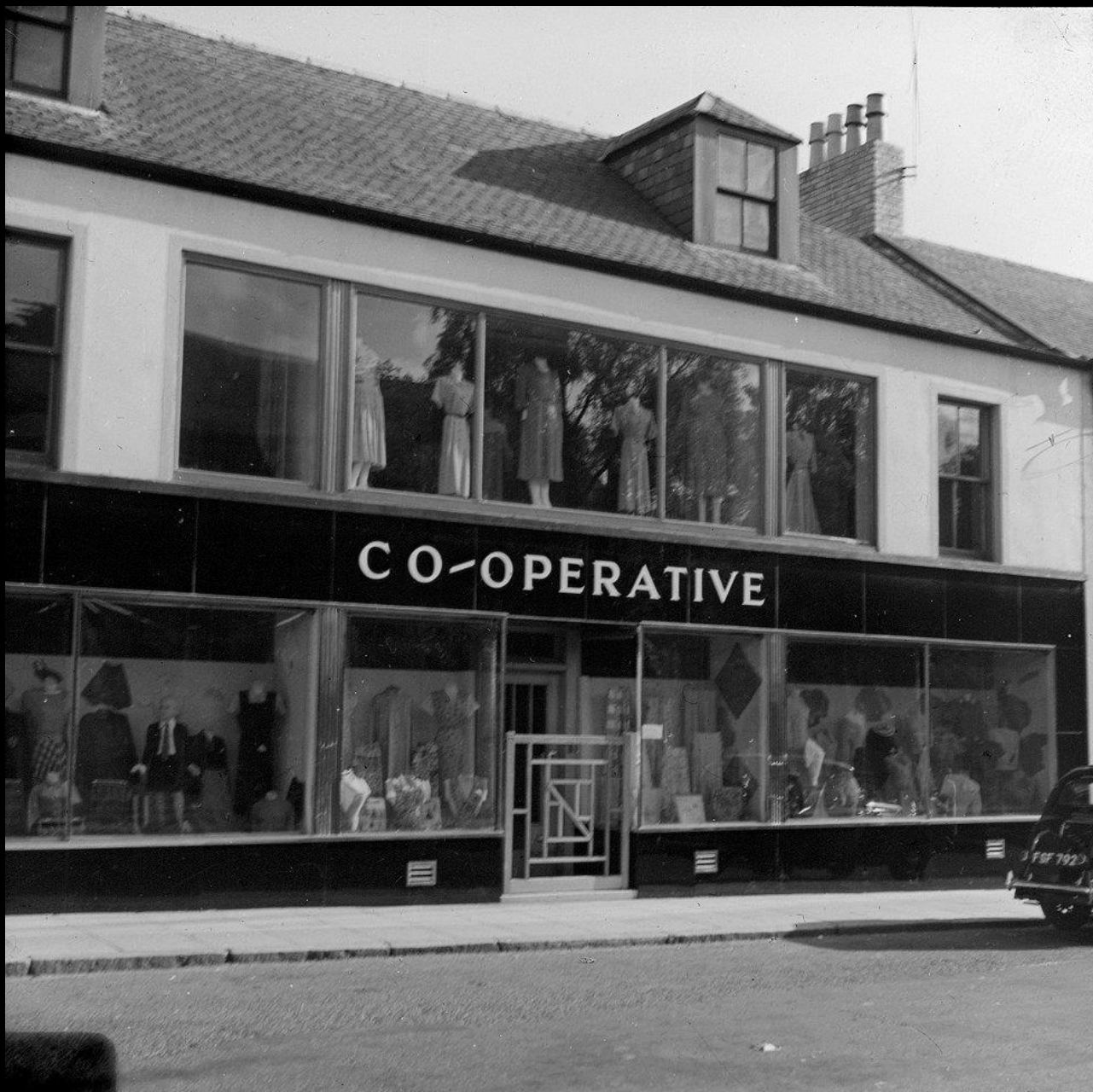
Co-Operative Clothing Department, 23-25 Loudoun Street