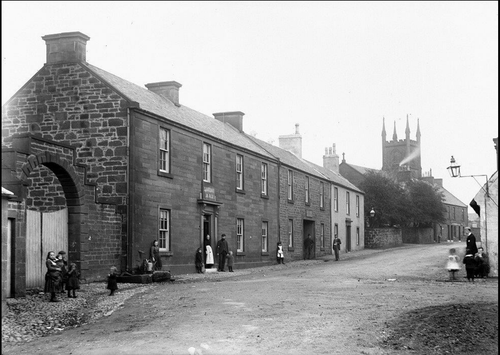
Loudon Arms now The Fairburn Hotel