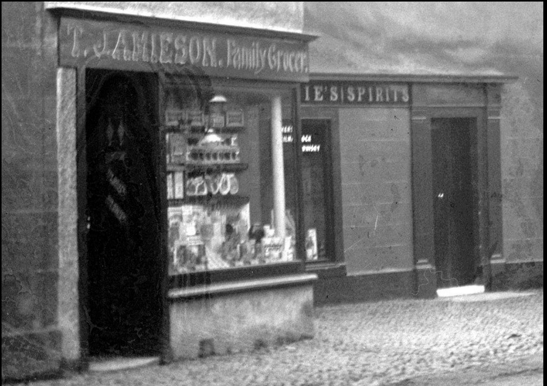
Tam Jamieson's shop previously located outside Poesie Nansie's