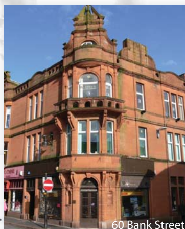
60 Bank Street