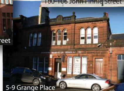
5-9 Grange Place