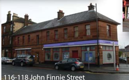
116-118 John Finnie Street