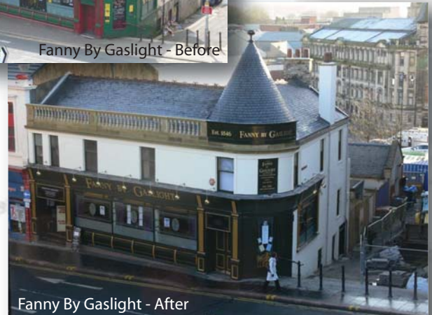
Fanny By Gaslight - After

Repair projects which are due to start in 2013:-