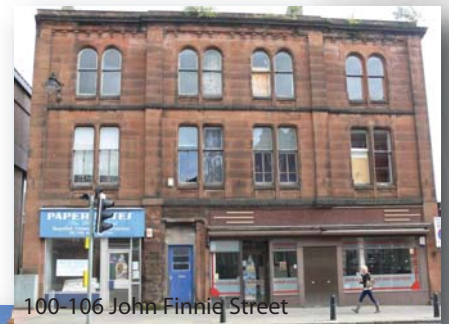
100-106 John Finnie Street