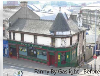
Fanny By Gaslight - Before