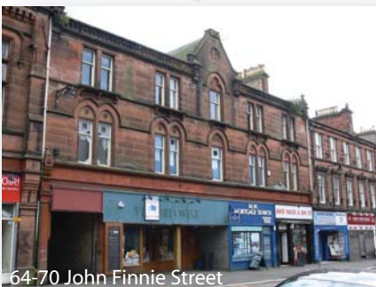
64-70 John Finnie Street

Repair projects which are due to start in 2013:-