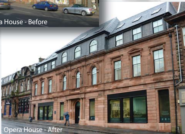
Opera House - After