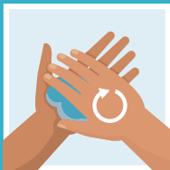
Wash for 20 seconds