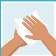
Dry with a paper towel