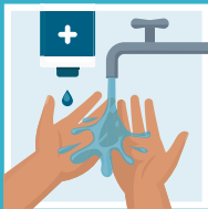
Soap and water