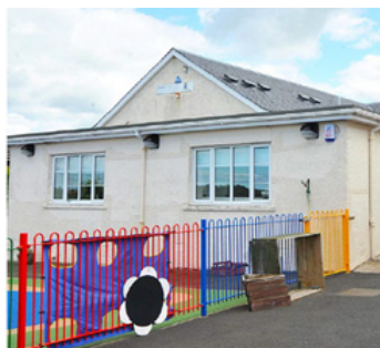
Littlemill Primary School and ECC