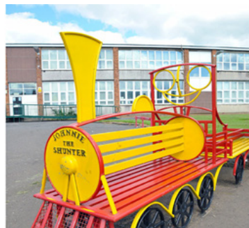
Drongan Primary School and ECC