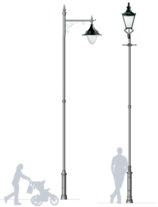
Pictures left to right – Traditional wall mounted light outside Burns House Museum, cpost light located on Loudoun St, Proposed lighting to be installed across Loudoun Street and visitor carpark, Proposed lighting to be installed across the lanes.