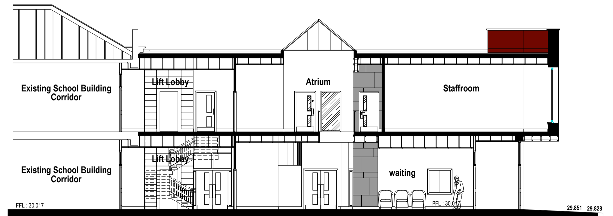
CROSS - SECTION G - G