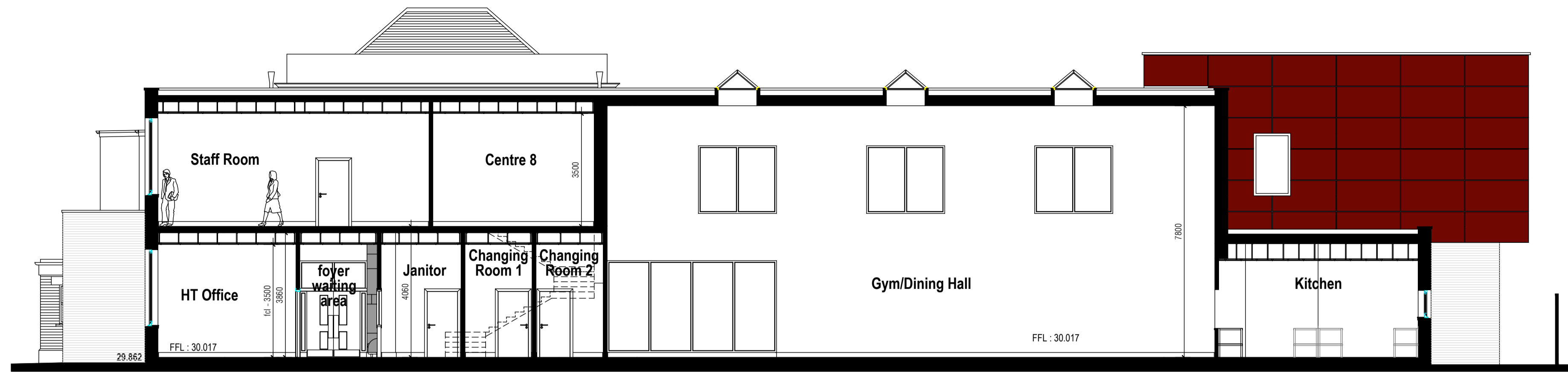
CROSS - SECTION A - A