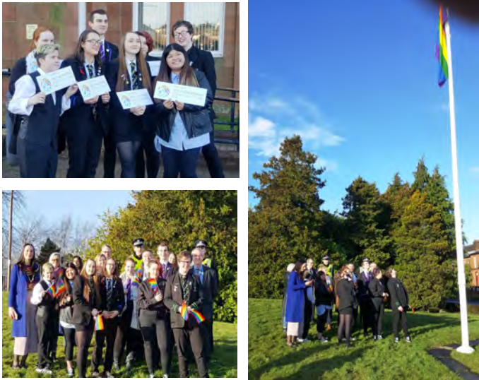
Some members of the Executive Cabinet took part in the Celebrations as part of the Year of the Young People.